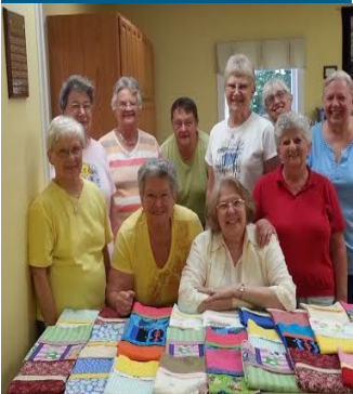
First Christian Church of Freedom Ladies Guild